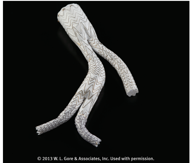
Figure 2. The GORE® EXCLUDER® Iliac Branch Endoprosthesis.

Although not all patients with iliac aneurysms undergoing EVAR have suitable anatomy for treatment with the currently available iliac branch devices, 11,12 EVAR with hypogastric artery preservation should be strongly considered in those with suitable anatomy. Hypogastric artery preservation may have the most beneficial impact in younger and more active patients and in patients with bilateral iliac artery aneurysms who are more likely to be affected by buttock claudication. In patients with multifocal aneurysmal disease or complex aortic aneurysms, hypogastric artery sacrifice increases the risk of spinal cord injury and paraplegia and is a near absolute indication for hypogastric artery preservation. Although the risks of hypogastric artery sacrifice in each individual